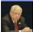
Richard Dreyfuss W.